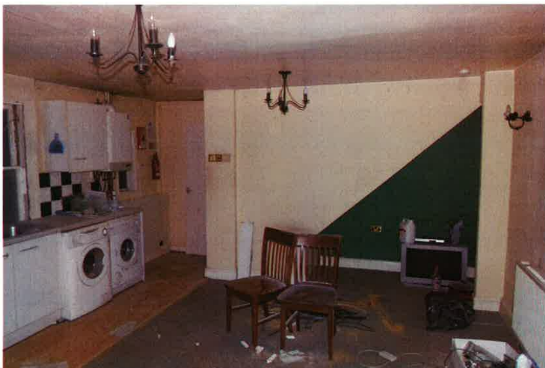
S1 – 20 th Century staircase to be removed.