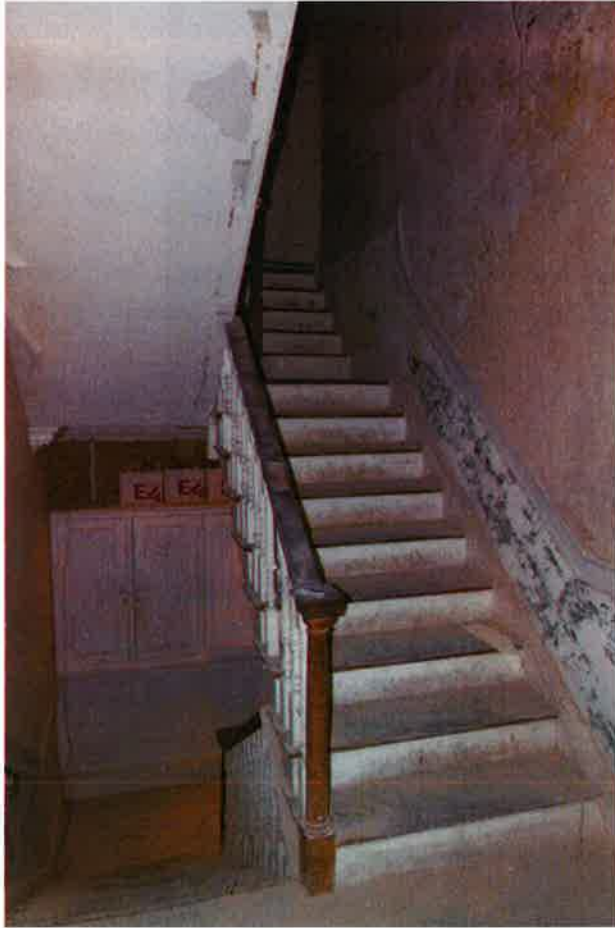
General Condition of Stairs