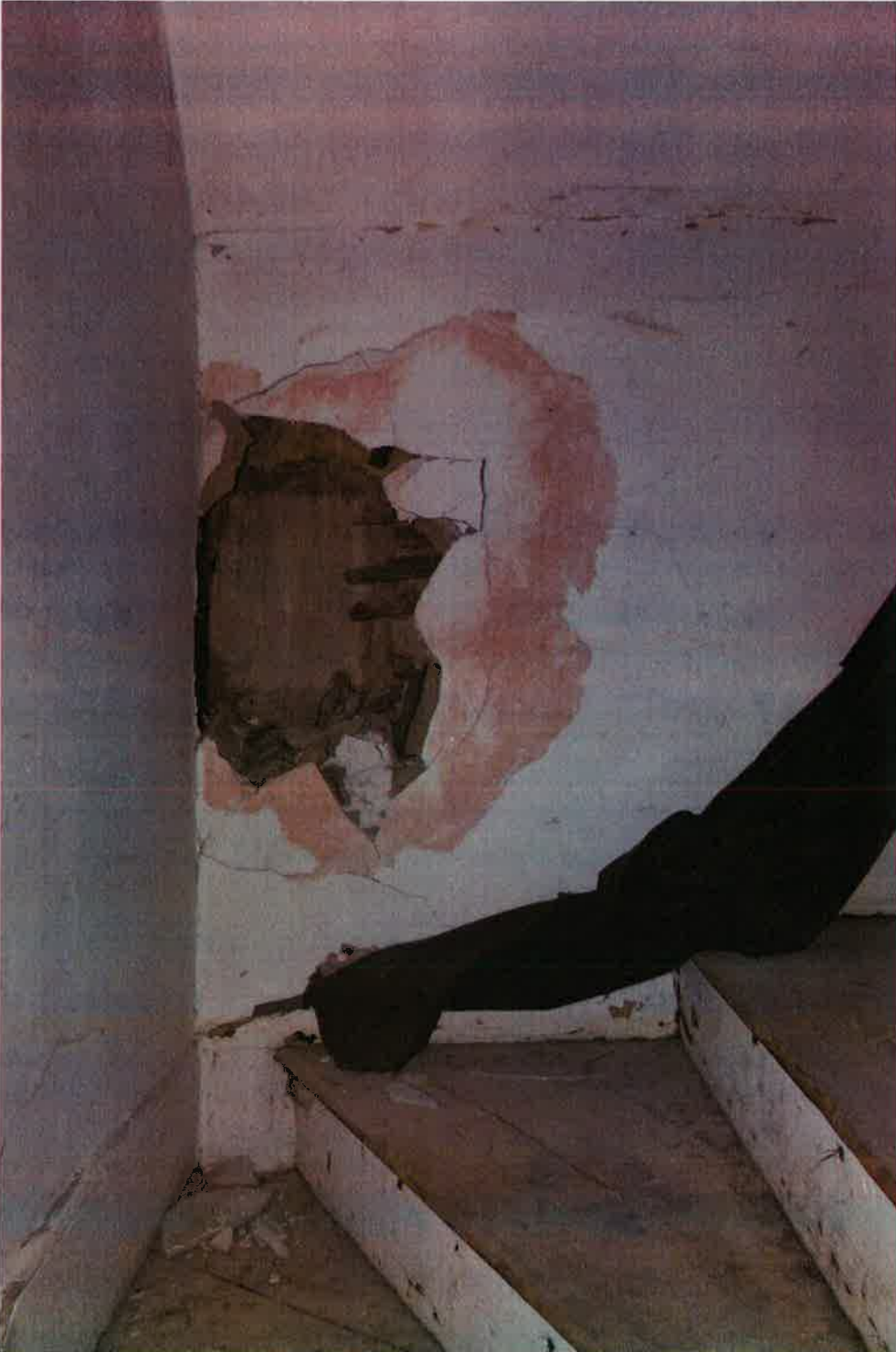
Plaster work in poor condition through building