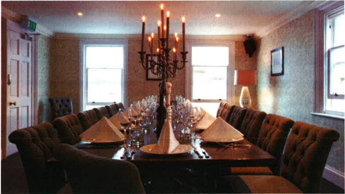
(Image of Library private dining space that will be included by extension of licensed area)

Licensing Application Ref 13/02473/LAPRE