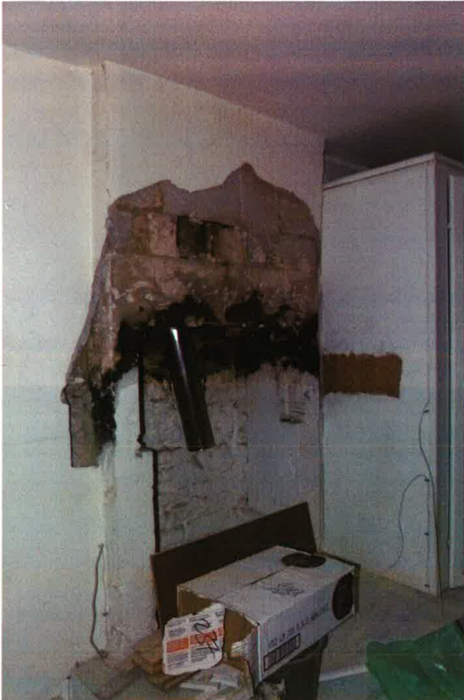
Room S6 – features removed