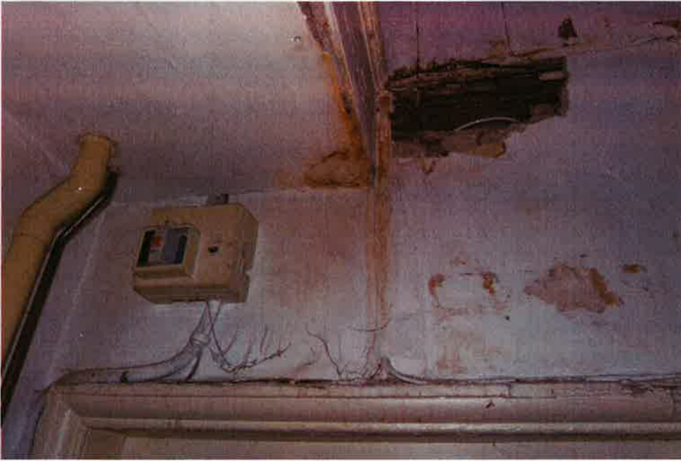
General Condition of building