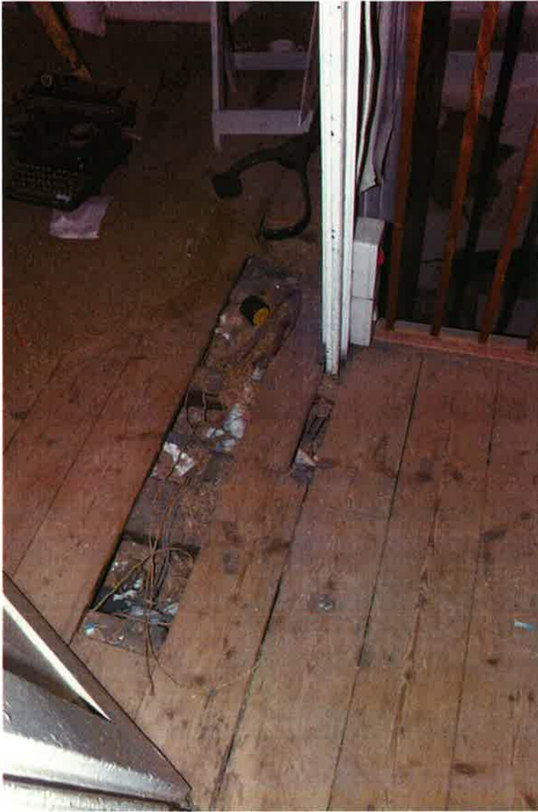
Many floor boards missing/removed – many rooms have been replaced with chip board