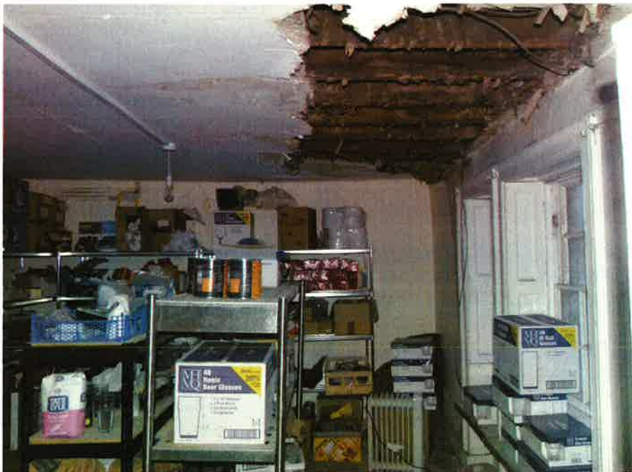
Room S6 – leak damage. Ceiling in danger of collapse