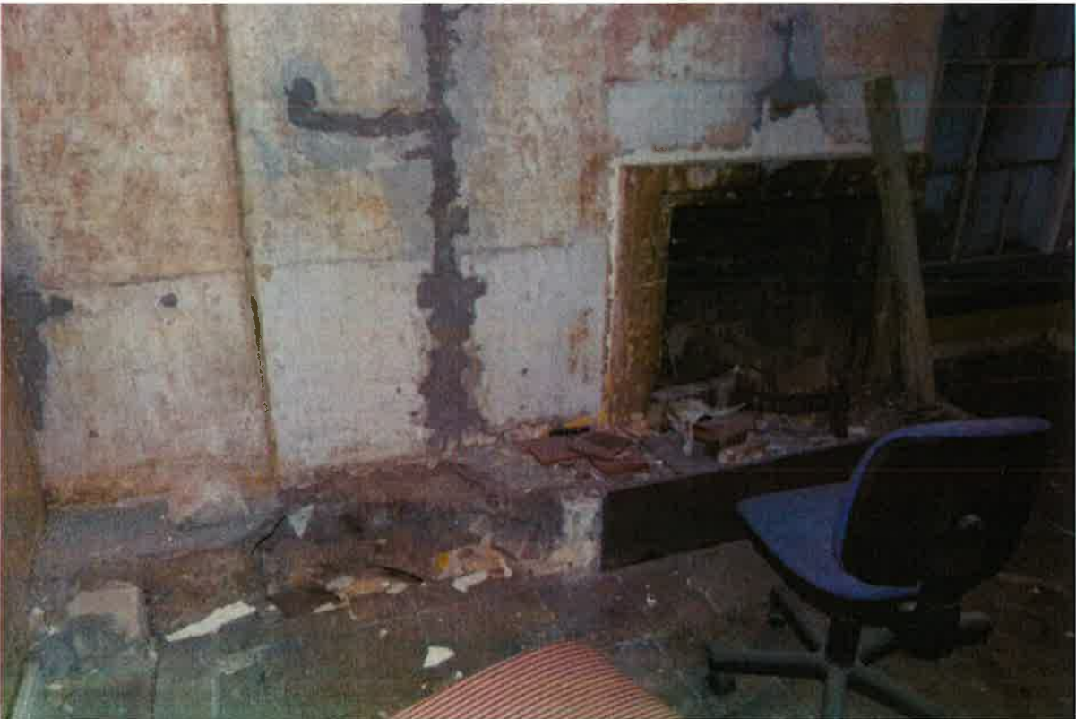
Rm S5 – derelict condition