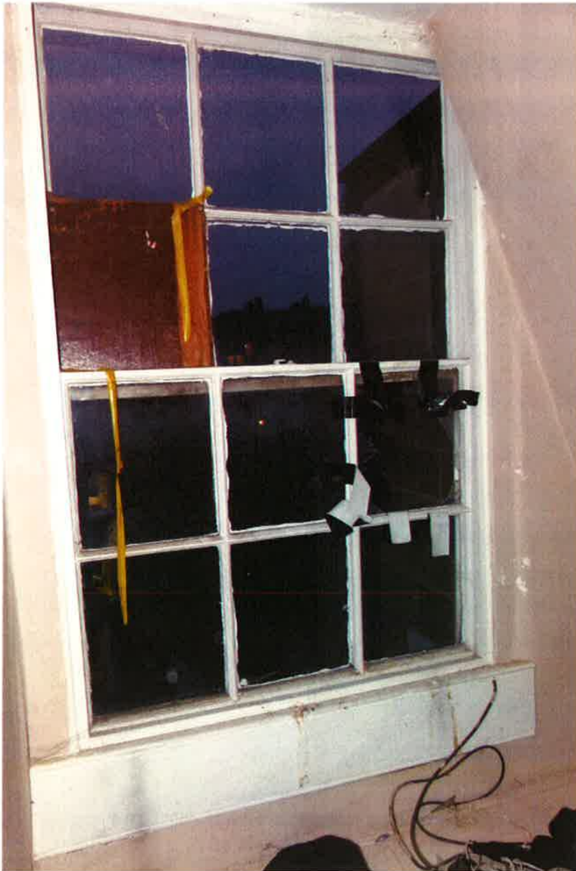
Typical condition of sash windows