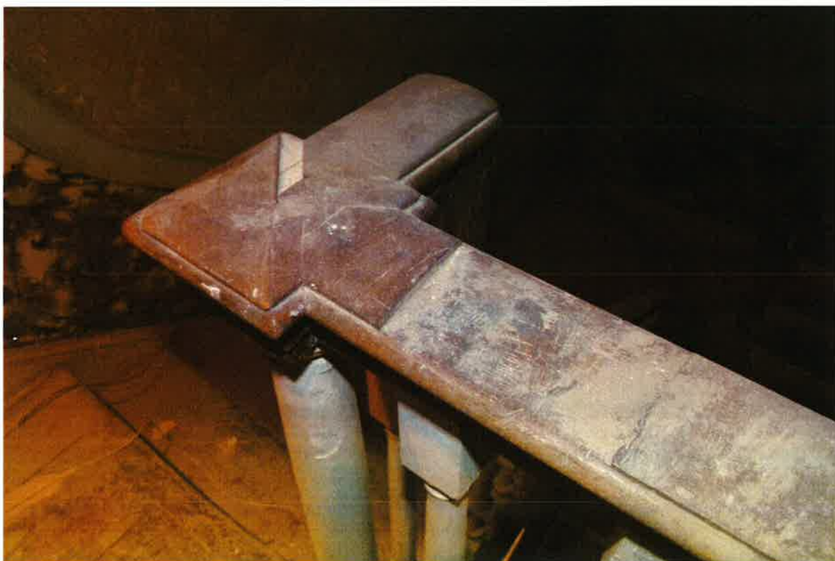
Banisters and Staircase in need of refurbishment