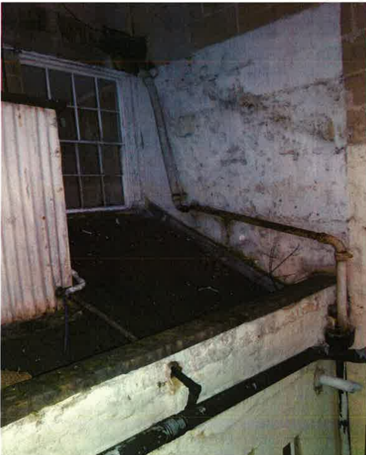
General condition of gutters and external area